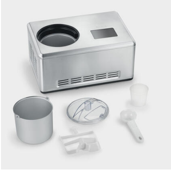
Ice cream scoop and measuring cup included.